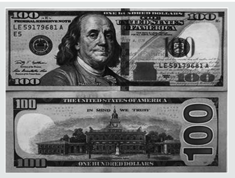
Figure 1: An example of a $100 bill follows.

Figure 1 Recognizing that the world was built from people using their Minds, facilitates social reform from being primarily guided by money considerations, to at least some emphasis that money, and what it is used for, is a creation from and for society by people using their Minds. Social guidance may be more socially significant today, than any other point in history. A two-penny tax on each credit card transaction could generate than $1B annually for social purposes, perhaps health care (for instance the poor). Why Not? The people paying the credit card fee would be the people getting health care. Obviously, the funds could be used for any social purpose, but should be used to impact the greatest number of people. A better use of the money generated may be to use it as a fund for all Politicians raising money for election purposes. In other words, this could minimize, or perhaps eliminate, the need for big donors who have significant control of the Congress and Senate in America. If more money is needed for political campaigns than merely increase the tax to 3 peenies which would generate multiple billions of dollars annually.