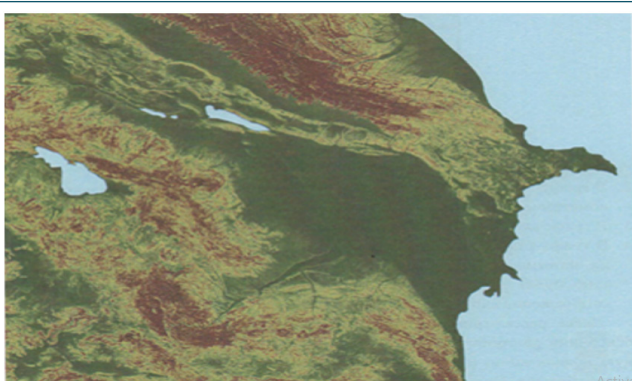
Figure 3: Angular slopes map developed in accordance with method S slope based on a digital model of Azerbaijan hypsometric.

a) In menu Spatial Analyst choose a Surface Analysis, then Aspect-method dialog box appears (Figure 3)