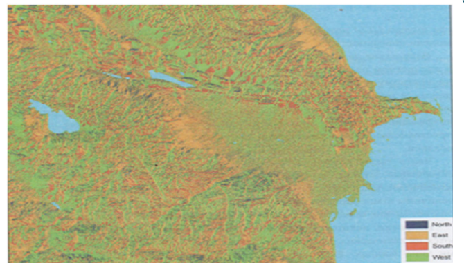
Figure 4: Map of exposures of the slopes, developed based on digital hypsometric put Azerbaijan.

layer with the designated (red) territory, which satisfies the requirements of the investor (Figure 4) [13-15].