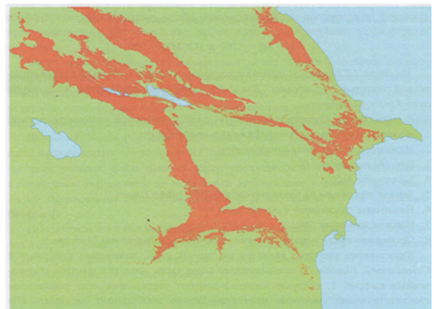
Figure 5: Result of the spatial analysis to define the territory of Azerbaijan, the relevant requirements of the investor.

The resulting image points to a very extensive array, located in the foothill zone of Azerbaijan. It is clear that in such a large territory does not satisfy any investor to potential localization object. In this regard, you can narrow the boundary parameters of each criterion. For example, the choice of the territory where the inclination does not exceed 1 degree. In the analysis process can also take into account additional criteria, such as location, investment plot at a distance of not less than 500 m from the nearest coastline and 1000 m from the urban areas (Figure 5). The possibilities are endless and depend solely on the needs of the user of GIS and spatial information availability [15-18].