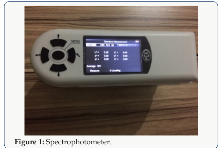
Figure 1: Spectrophotometer.

The samples were kept in distilled water for a total of 14 days (the solution was renewed every 3 days). Initial color measurements were made with a spectrophotometer (Figure 1).