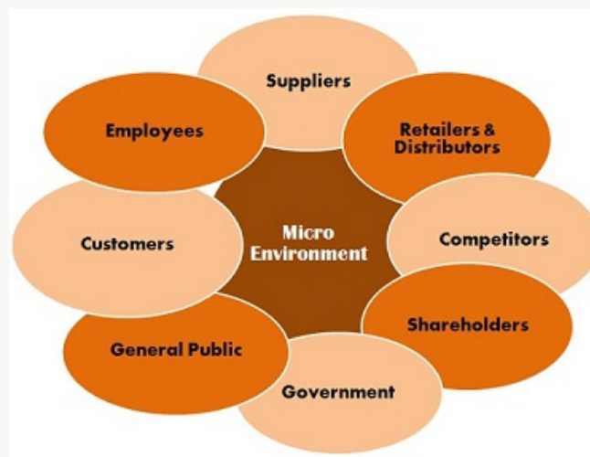
Figure 3: Micro environment factors [15].

The Micro Marketing Environment includes all those factors that are closely associated with the operations of the business and influences its functioning on day to day basis. Therefore, before deciding corporate strategy companies should carry out a full analysis of their micro environment. The micro environment factors shown in Figure 3 include customers, employees, suppliers, retailers & distributors, shareholders, Competitors, Government and General Public. Businesses cannot always control micro environment factors but they should endeavor to manage them along with Internal Environment and Macro Environment factors Figure 3.