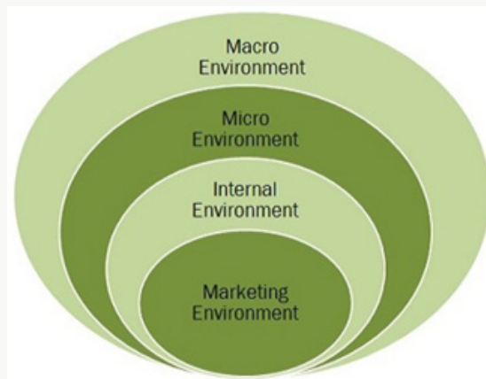
Figure 1: Business environment factors [15].

The business environment is also known as marketing environment [14]. The marketing environment factors can be internal (within the organization) or external (outside the organization). The external factors can further be divided into micro and macro environment factors. Thus, the marketing environment can be broadly classified into three components as shown in Figure 1.