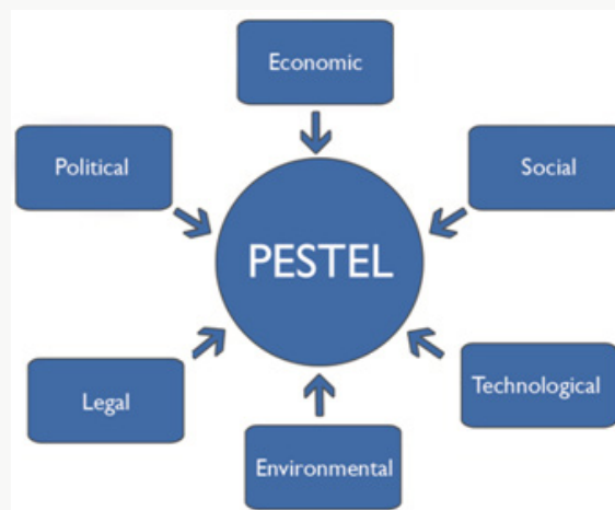
Figure 4: Macro environment (PESTEL) factors [17].

The macro environment refers to all forces that are part of the larger society and affect the micro environment. Factors affecting organization in macro environment are known as PESTEL, that is: Political, Economical, Social, Technological, Environmental and Legal shown in Figure 4.'