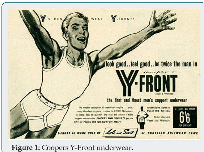
Figure 1: Coopers Y-Front underwear.

The fitted knee-length apparel that men wore beneath their pants was not very comfy. This led to the invention of the elastic waistband in the year 1925 and this led to the development of boxer shorts. Thus, the underwear for men become much more resilient and supportive [7]. 'Look good... Feel good... Be twice the man in Y-front', was the quote that described the very first men's brief (Figure 1). This came in as a pleasant surprise for the male population who needed something lot more supportive down there [8]. However, it is lesser known fact that boxer shorts were not the very first invention in men's underwear industry. Jockstraps were invented way before in the late 1800s. This skivvy style was specifically invented to provide comfort and support to the cyclists [9]. Pioneered by the designer, John Varvatos, boxer briefs were introduced in the year 1990. Combining the length of the boxers and the snug fit of brief, this underneath article took the entire industry by storm. The aesthetically revolutionary underneath article is till date the most used style [10].